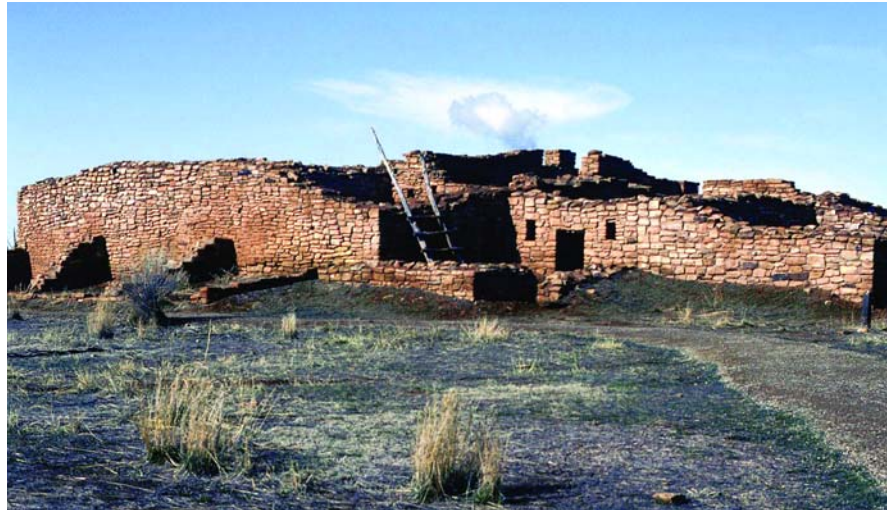
Canyons of the Ancients National Monument, Colorado

• Volunteer! National Monuments receive minimal federal funding for landscape rehabilitation, archaeological site protection, and educational outreach; federal agencies rely on citizens to pitch in. Opportunities to volunteer exist at every level of skill and availability, from a day of trail maintenance to a summer of developing educational curricula. BLM estimates that 20,000-30,000 hours of volunteer time is donated to Utah's Grand Staircase-Escalante Monument each year. Check out "Volunteer Vacations" at www.AmericanHiking.org for opportunities to get outside and lend a hand in a Monument near you.